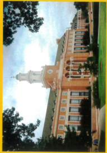
Oklahoma State University

"You can't go back and change the beginning, but you can start where you are and change the ending." C.S.Lewis