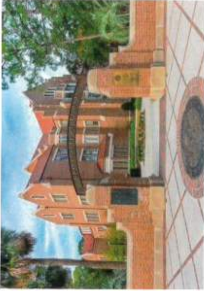
University of Florida